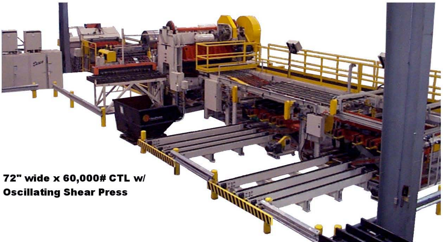
72" wide x 60,000# CTL w/ Oscillating Shear Press

COIL WEIGHT ..... 60,000# Max COIL WIDTH ..... 8" TO 72" COIL I.D. .... 24" COIL O.D. .... 36" TO 72" MAX. MATERIAL BEING RUN ..... MILD STEEL, CLASS "A" MATERIAL THICKNESS ..... .125" @ 72" WIDTH MATERIAL THICKNESS ..... .200" @ 48" WIDTH FEED LENGTH RANGE ..... 6" TO 96" FEED LENGTH ACCURACY... +/- .010" ACCURACY ACROSS DIAG... +/- .060" SHEAR OSCILLATION ..... +/- 30 deg. STACK WEIGHT ..... 10,000# MAX. STACK HEIGHT ..... 15" TO 18" OVER PALLET PLANT VOLTAGE ..... 460V., 3PH., 60 Hz